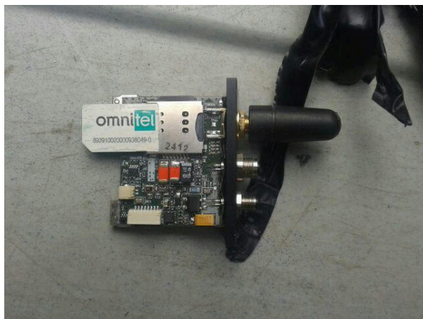
A device equipped with a SIM card found in a vehicle in Italy, in August 2019 5 .