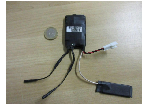
Microphones found inside a power outlet in a building in Bologna, Italy, in January 2018 1 .

Hidden physical surveillance devices are typically used by law enforcement and intelligence agencies to obtain information about a target when traditional surveillance methods are insufficient. For example, if a suspect never talks about sensitive topics on the phone—making the monitoring of their phone useless—law enforcement may resort to installing a hidden microphone in the suspect's home, in the hope of capturing interesting conversations. In many countries, the installation of such devices is regulated by law and must be approved by a judge.