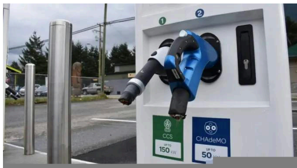
Electric vehicle charging station with severed cables.

What should anarchists take away from this? How can we continue to attack this panoptic hellscape and get away with it?